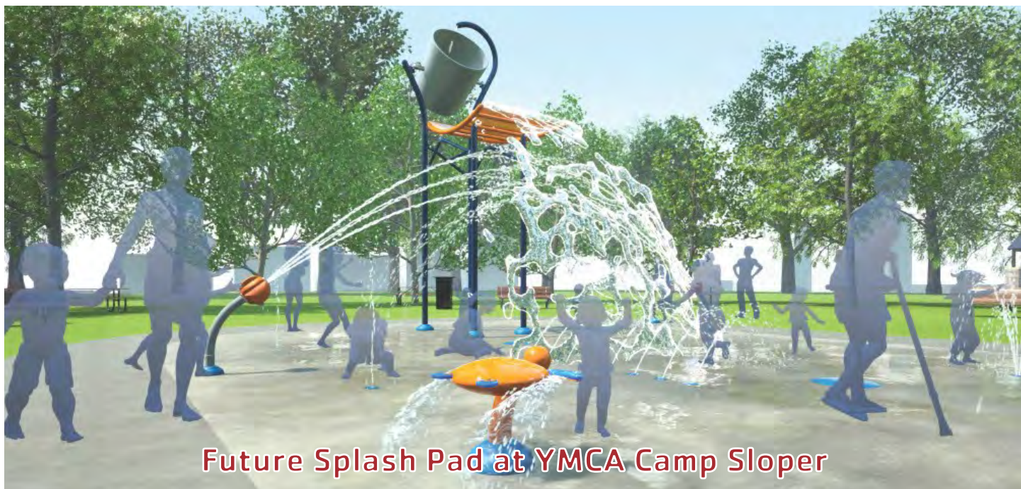
Future Splash Pad at YMCA Camp Sloper